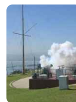
Noon Gun http://bokaap.co.za/noon-gun/