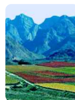
Winelands Tours and Wine Tasting