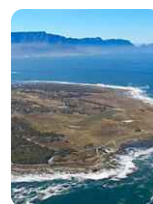
Robben Island Museum www.robben-island.org.za