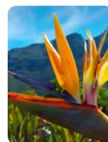
Kirstenbosch National Botanical Gardens www.sanbi.org/gardens/kirstenbosch