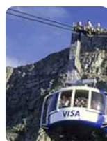
Table Mountain Aerial Cableway tablemountain.net