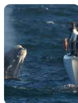
Whale Watching in Hermanus www.hermanus.co.za/whales.asp