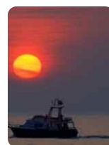
Sunset cruise – departing from the V&A Waterfront www.waterfrontboats.co.za/