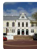
Cape Town Museums www.iziko.org.za